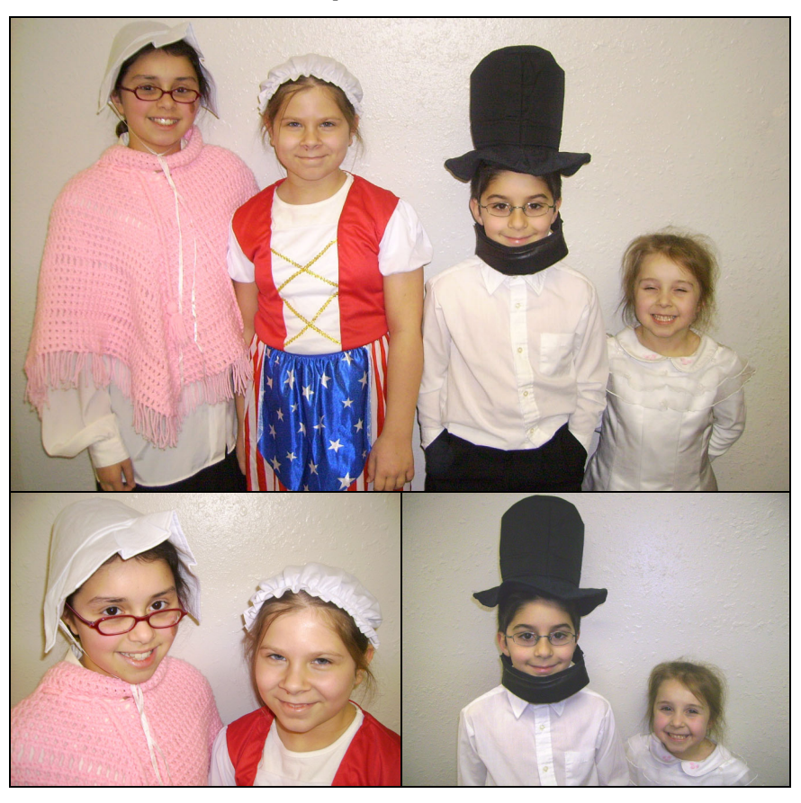
Feb 20, 2007: Patriotic Dress-Up Day at ACA