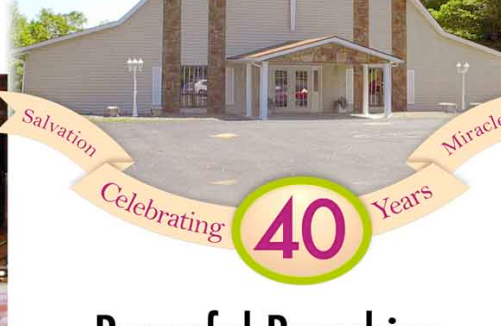
Powerful Preaching Anointed Music Ministry