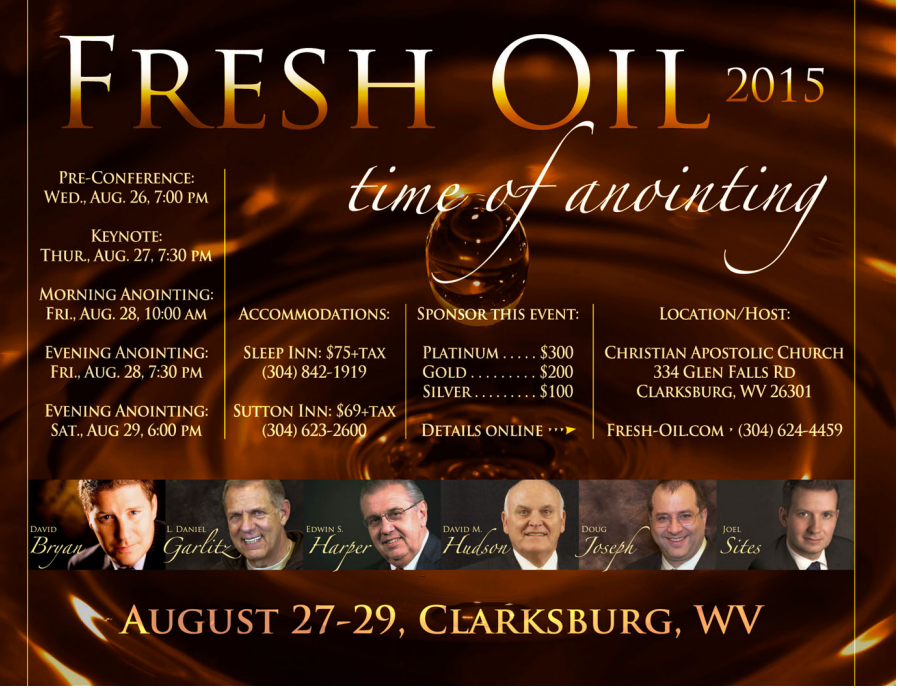
Please note the only day service on Friday, August 28 at 10:00 am!