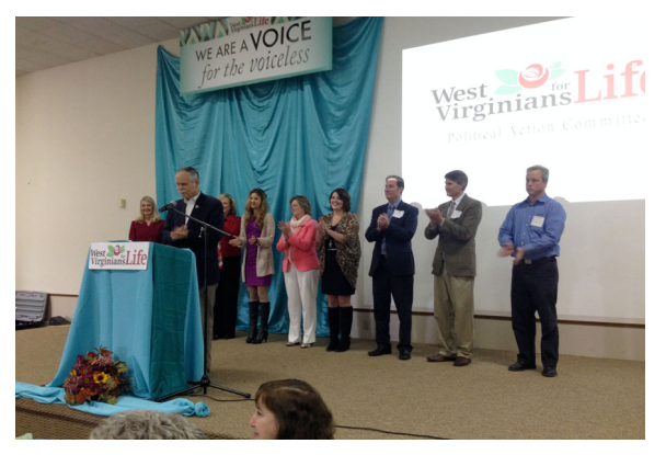
Above: Elected Officials on hand for the Pro-Life Convention.