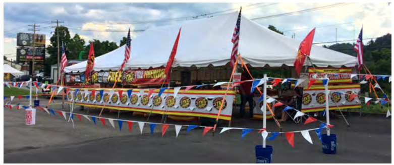
Come help! Come shop! Good fellowship, fun, and all for a good cause!