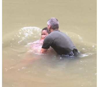
Obeying Acts 2:38 is how to fulfill Matt. 28:19. (See Acts 2:38, 4:12, 8:16, 10:48, 19:5, 22:16.)